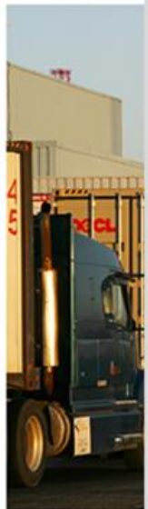
Most container term longshoremen's unk