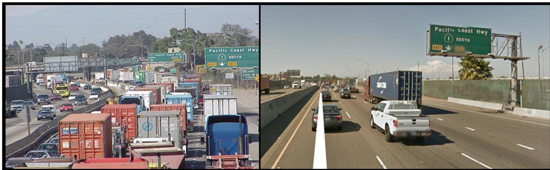
Before the OffPeak program

Reduced daytime volumes from 88% to approximately 50+%